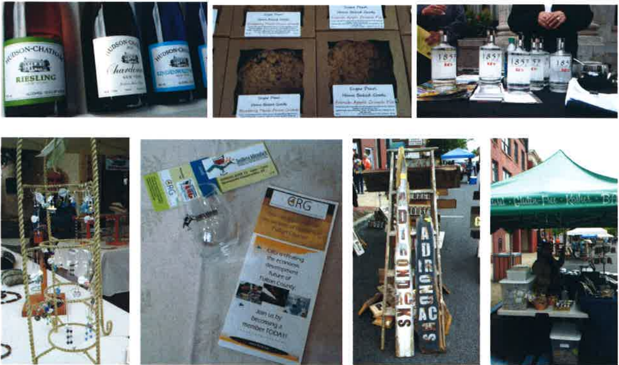
Photos of Southern Adirondack Wine & Food Festival