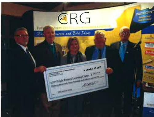
Microenterprise Grants Awarded