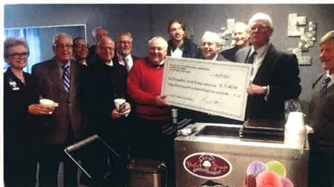
Frozen Parts, Inc.