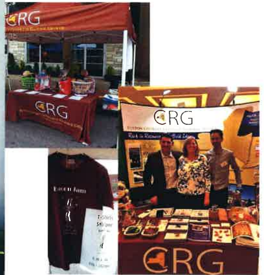
Marketing Outings and Events