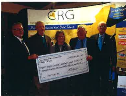
Bright Futures Learning Center

Two of the businesses are pictured below.