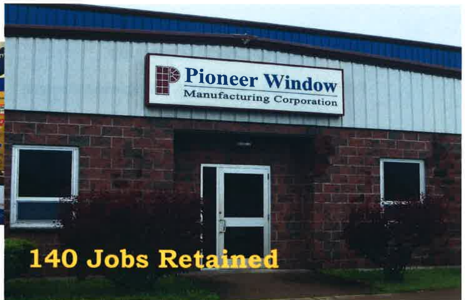
140 Jobs Retained